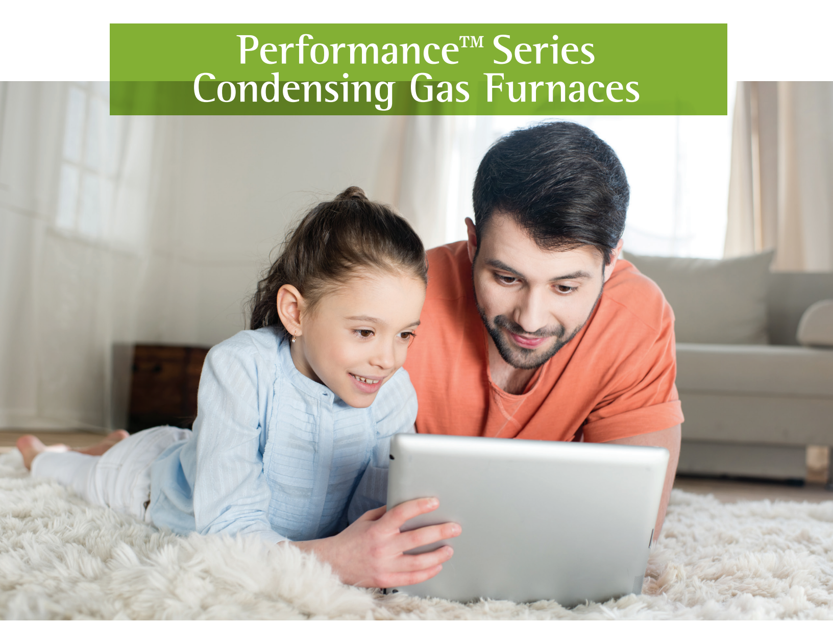
Smart, high-efficiency comfort with up to 96.5% AFUE